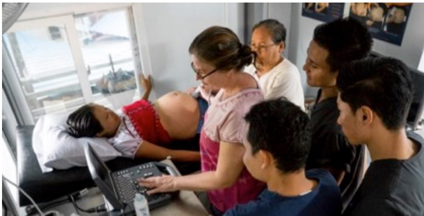
Up to 50 patients a month are accessing ultrasound services at the T-RAD Clinic in Kyaukkyi. Here, students are learning about ultrasound procedures.

PRADA have one permanent volunteer in the field working with a project that trains Karen physician assistants and midwives in Bago Division, Myanmar. Australian funds contributed to the on-going training of Karen medics as well as medics at the Health Training facility in Shan State. Besides training quality medics and midwives, these two projects also provide their local areas with a reliable and trustworthy health service. Australian funds also contributed to providing support for patients who needed to be referred from remote communities for specialist care and treatment.