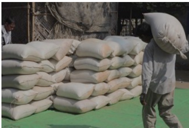
Sacks of rice ready to distribute in Rohingya internment camps near Sittwe, Rakhine State, Myanmar in January 2018.

PRADA continued to contribute to the #SAVEtheRohingya campaign and $4,164AUD was sent for this purpose. An additional $4,792 AUD was sent to help with relief efforts in Shan State after severe floods, and in Kachin State after fighting caused communities to flee.