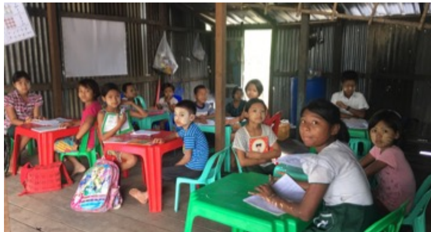
SDG 4: Obtaining a quality education is the foundation to improving people's lives and sustainable development.

Please Note: In December 2018 Partners Relief & Development Australia Inc withdrew from the Partners Relief & Development Federation. From February 2019 we will operate under the name SUSTAIN Projects – Myanmar Inc.