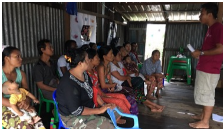
Parents whose children are part of the program attending a monthly meeting.

Education is essential for change in Myanmar yet many children are unable to attend school because of conflict, poverty or lack of infrastructure. During 2018 PRADA have been able to contribute to the support of children living in a large Yangon slum by providing them with basic education, a healthy meal each day, as well as health education and life-skill training for their parents.